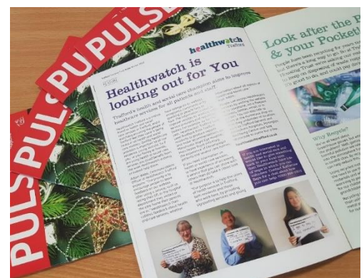
Feature on Healthwatch Trafford in Pulse, the Trafford Housing Trust magazine

During October and November Healthwatch Trafford enter and view volunteers undertook visits to six care homes and two homecare providers in Trafford as part of Trafford Council's Dignity in Care Award six monthly reviews. The Dignity in Care Campaign was launched in 2006 by the Department of Health to generate an emphasis on improving quality of care and experience of citizens using Health and Social Care services. The Trafford Dignity in Care Award provides an opportunity for providers to take this commitment a stage further by evidencing that their service meets the requirements of the ten Dignity Challenges. The role of the Healthwatch Trafford volunteers was to provide Trafford Council with observational evidence on how the care